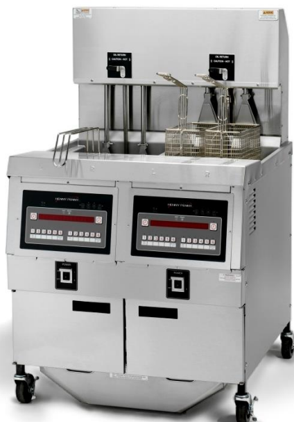
OGA 322 2-well gas auto lift open fryer

OGA 321 1-well gas OGA 322 2-well gas OGA 323 3-well gas