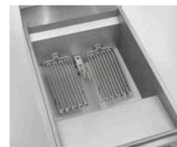
Immersed element models are the lowest cost alternative for electric fryers.